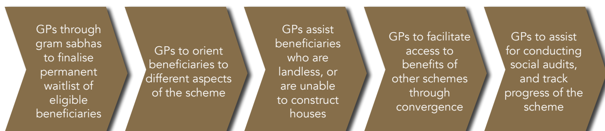
Figure: Role played by Gram Panchayats in the PMAY

The scheme places considerable responsibility on gram panchayats (GP) for the implementation of the scheme. This is summarised in the figure below.